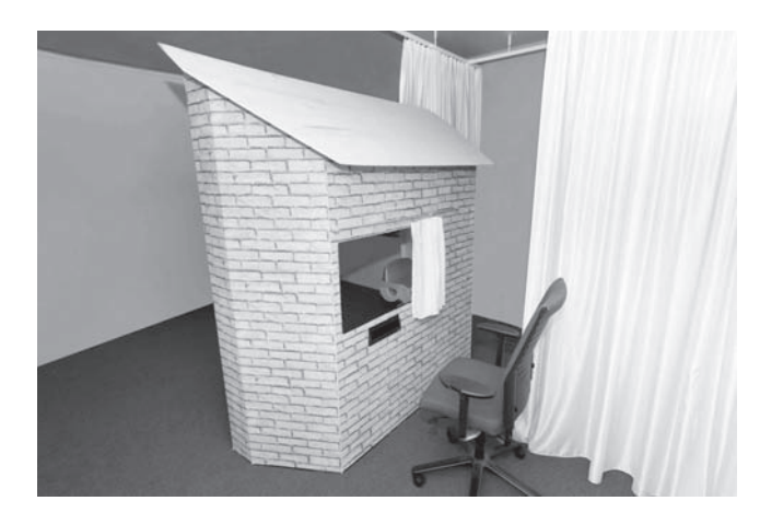
Fig. 1. House apparatus. While infants viewed video stimuli on a monitor placed in the window, their eyes were tracked by an eye tracker through a slit below the window.

The stimuli were shown at a monitor resolution of 1920 × 1080 pixels in the following order: an attention-grabbing animation (4 s), a gray screen (3 s), and an action stimulus showing an adult performing either an introductory action (21 s; introductory trial) or one of two test actions (33 s each; test trials). In the introductory trial, the action stimulus showed the adult playing a game without needing help. In the test trials, one of the two actions portrayed him stacking cans to form a tower. After 28 s, the adult dropped the last can on the ground, pretending the drop was accidental. In the other test trial, the