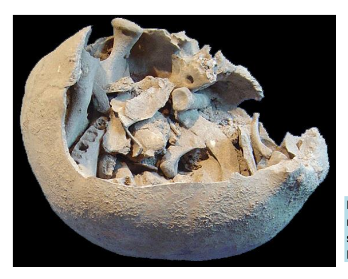
Image: 9,500-year-old skull cap used as funerary receptacle. The mutilated and burnt bones of the same individual were deposited inside.

In eastern South America skeletal remains dating to 10,000 years ago are rare, precluding the proper study of their ritual dimensions. In a study published this week in the journal Antiquity an international research team led by the Max Planck Institute for Evolutionary Anthropology in Leipzig, Germany, and the University of São Paulo, Brazil, present their new findings on 26 human burials that date to this period and had been discovered at the archaeological cave site Lapa do Santo in east central Brazil.