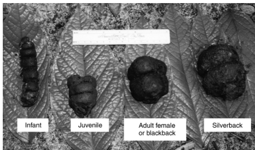
Figure 1 Western gorilla faeces from individuals of various age classes. The age of the individual who slept in each nest can be estimated from the size of the associated dung. The ruler above the dung measures 15 cm.

throughout the study site. In addition, we analysed a set of samples from one consecutive tracking series in which we tried to track one gorilla group from nesting site to nesting site over the course of 8 days. Each morning we located the nesting site used by that group the night before and collected samples at each nest.