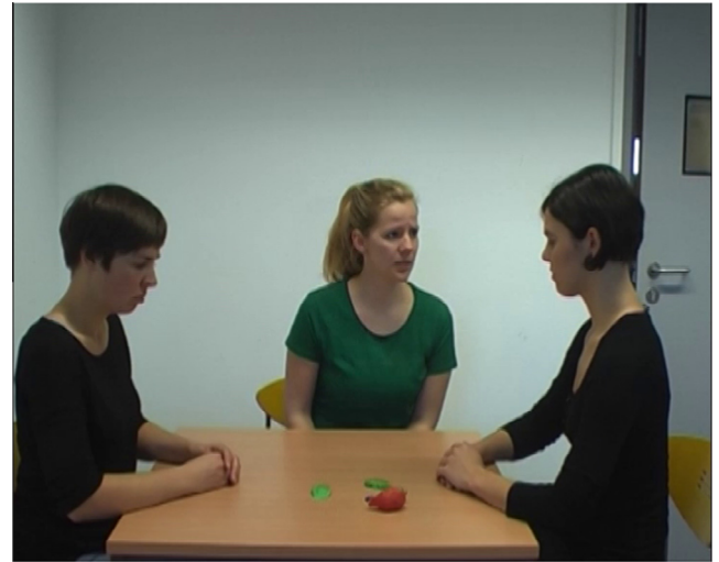
Fig. 1. A still frame from an Enforcement video, showing the enforcer, in the middle, chiding the transgressor, on the right, for destroying the clay bird.

Children were randomly assigned to one of 24 presentation orders which counterbalanced which observer was the enforcer versus non-enforcer, whether an Enforcement or Non-