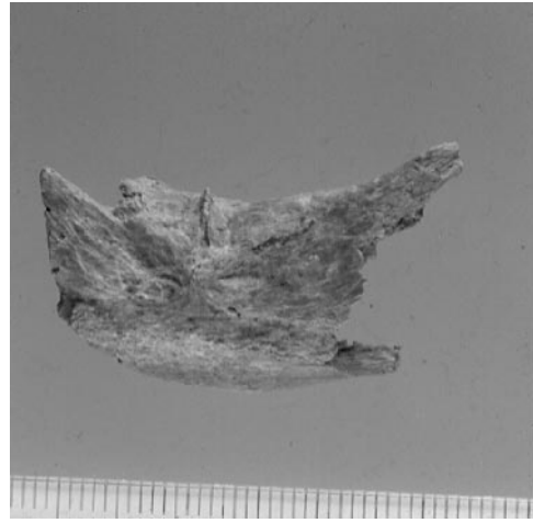
Fig. 2. The NN 52 inferior mandibular symphysis. Scale as in Fig. 1.

direction of Schmitz and Thissen began in this area. These excavations led to the discovery that the base of the south valley wall was left intact, and cave sediments were located adjacent to this remnant. Excavation of these deposits resulted in the recovery of Paleolithic artifacts, Pleistocene faunal remains, and some 24 fragments of human bone from the clay sediments on the valley side of the remnant (9). That these must at least in part represent remains from the Kleine Feldhofer Grotte was confirmed when a small piece of human bone (NN 13) was found to fit exactly onto the lateral side of the left lateral femoral condyle of Neandertal 1 (1). In 2000, additional excavations were conducted at this location, and a much larger series of fauna, artifacts, and human skeletal fragments was recovered. Two cranial fragments from these excavations were found to fit onto the original Neandertal 1 calotte.