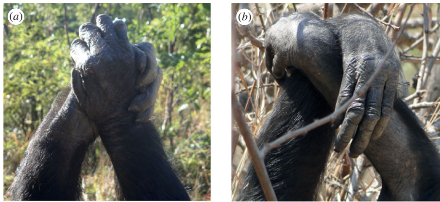
Figure 1. Grooming handclasp style examples: (a) palm-to-palm and (b) wrist-to-wrist.