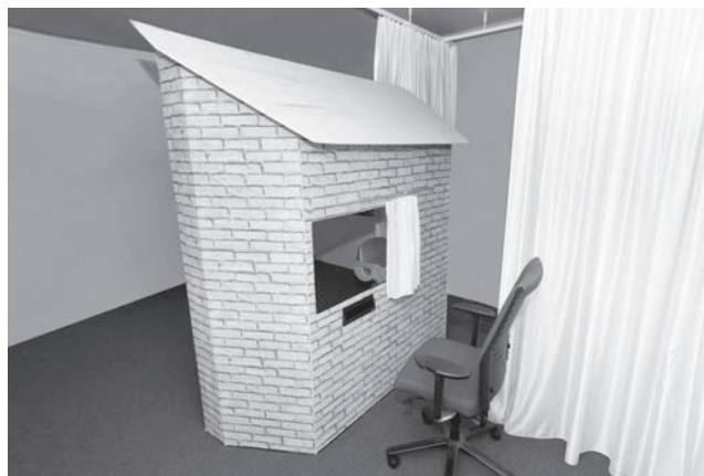
Fig. 1. House apparatus. While infants viewed video stimuli on a monitor placed in the window, their eyes were tracked by an eye tracker through a slit below the window.

The stimuli were shown at a monitor resolution of 1920 \times 1080 pixels in the following order: an attention-grabbing animation (4 s), a gray screen (3 s), and an action stimulus showing an adult performing either an introductory action (21 s; introductory trial) or one of two test actions (33 s each; test trials). In the introductory trial, the action stimulus showed the adult playing a game without needing help. In the test trials, one of the two actions portrayed him stacking cans to form a tower. After 28 s, the adult dropped the last can on the ground, pretending the drop was accidental. In the other test trial, the