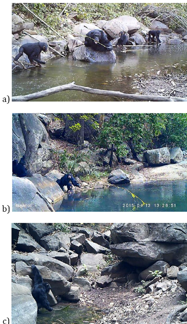
FIGURE 2 Screenshots of algae fishing filmed at three different locations (a, b, and c) in Bakoun, Guinea

Individuals varied in their degree of water immersion while algae fishing. Although chimpanzees generally avoided entering the water while algae fishing, at times we observed individuals to have one or both legs up to the ankle underwater ( N = 24 ) or even all four limbs in the water ( N = 5 ). With respect to the arms, sometimes the fishing arm was underwater up to the elbow ( N = 11 ), but more frequently just the hand was immersed ( N = 68 ). We also observed Guinea baboons ( Papio papio ) collecting and consuming algae, albeit using their hands only, and even co-feeding alongside chimpanzees in three out of six baboon algae fishing events recorded opportunistically on the camera traps (see Supplementary Video S2). We know of only one other primate, the black and white colobus monkey ( Colobus guereza occidentalis ), that has been reported to feed with its hands on algae in the swampy forest clearings of the Republic of Congo (Devos et al., 2002).