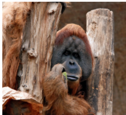
At best, apes, like this orangutan, would puzzle at communicative gestures such as pointing.

» Millennia of domestication have transformed dogs into communication professionals with an extensive repertoire of skills.