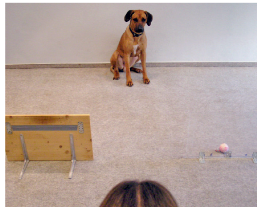
This study showed that dogs understand the perspective of humans. In most cases, they brought the toy that lay behind the glass barrier. They obviously knew that their test partner could see only that toy, and that the “bring” command could relate only to it.