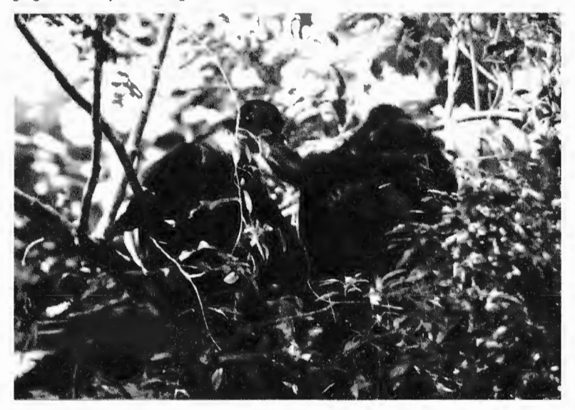
Figure 5.2: An adult female (right) carrying a Treculia fruit. Another female (left) is begging for food by extending her hand toward the owner's mouth.

Sexual behavior occurred during eight episodes, and the total number of sexual interactions was twenty-one. The majority (fifteen cases) accounted for genito-genital rubbing among female owners and recipients. Heterosexual copulations occurred five times, three times between a male owner and a female participant and twice vice versa. Following copulation, food was transferred from males to females three times. However, in another case a male owner copulated seven times in close succession with a female vigorously begging for Treculia but did not share the fruit.