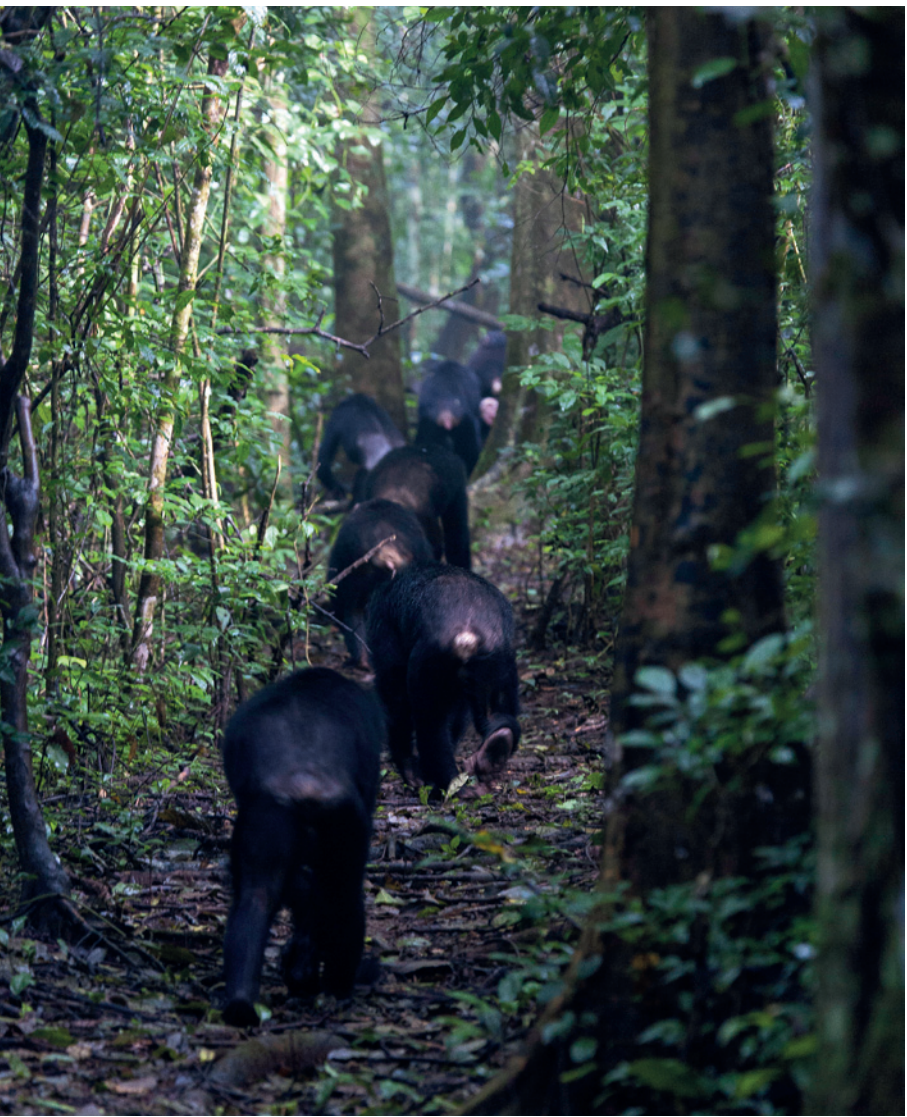
Figure 1 | Stable communities. The Sonso group of East African chimpanzees ( Pan troglodytes schweinfurthii ), from the Budongo Forest in Uganda, is estimated to be the oldest of the eight chimpanzee communities studied by Langergraber and colleagues<sup>4</sup>.

Large-scale genetic comparisons among the great apes have suggested that chimpanzees probably split from bonobos around 2 million years ago<sup>6</sup>. Concentrating on much finer timescales, Langergraber et al. estimate a time to the most recent common ancestor (TMRCA) ranging between 125 and 2,625 years for their eight chimpanzee communities. Because chimpanzee groups are