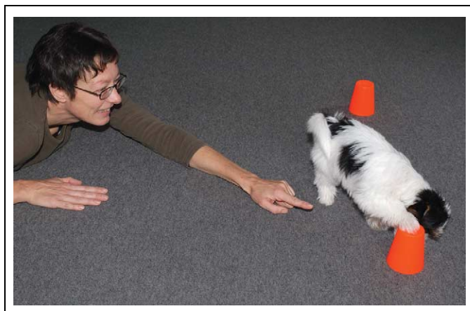
Figure 1. Dogs are more skilled than chimpanzees at using human behavioral cues (e.g. pointing) to find hidden food. In the basic test an experimenter places food so that the dog sitting across from her does not know in which cup it is hidden. Then the experimenter points in the direction of the correct cup and lets the dog choose a cup.

gazing to the target location (dog sees either the head turn or a static head looking towards a location); (iii) a human bowing or nodding to the target location; and (iv) a human placing a marker in front of the target location (a totally novel communicative cue). The dogs were even able to do the task correctly when the human walked towards the wrong container while pointing in the opposite direction to the correct container. In addition, dogs performed equally well whether cues were provided by conspecifics or humans. And in all of these cases, the dogs used the behaviors effectively from their very first trials, showing that they already possessed the required skills before the experiment. In many of these tests, over two-thirds of the dogs were significantly above chance as individuals.